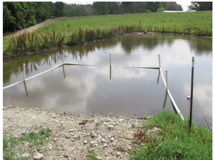
Figure 2. A heavy use area should be created within and in front of the floating limited access area.

There are other examples of temporary low-cost setups similar to a limited access floating fence. In some instances, a single-strand polywire fence is sufficient to limit cattle access to ponds without the more expensive setup described above. An example of a temporary floating access across a pond using polywire is depicted in Figures 3 and 4. If the banks