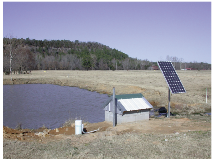
Figure 5. A pump is used to redistribute water from the pond to a water tank.

Gravity is used in most cases and is a reliable method of channeling water from the pond to the waterers. Since this happens at low pressure, larger pipes are needed to maintain the required volumes. A positive side effect is that low-pressure pipes are less expensive than high-pressure pipes. Care should be taken to maintain an adequate slope that keeps the water flowing and reduces air pockets that cannot be overcome just by back pressure from gravity. A pump may be used to redistribute water from a pond to water tanks (Figure 5). Gravity flow can also be used in conjunction with a pump, which can be reduced in size compared to pump-only systems.