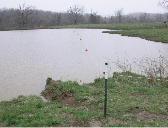
Figure 3. Temporary floating access across a pond using polywire.

of the pond are not steep or cattle can reach the water without walking into the pond most of the time, then a simple fence might be feasible. The polywire must be raised to a height that will allow the animals to safely draw water. Overall bank stability and soil type surrounding the pond should also be taken into consideration. With more shallow and rockier soils in the northern part of the state, this setup might be workable, compared to other parts of the state where deeper soils may quickly lead to the disintegration of the pond banks.