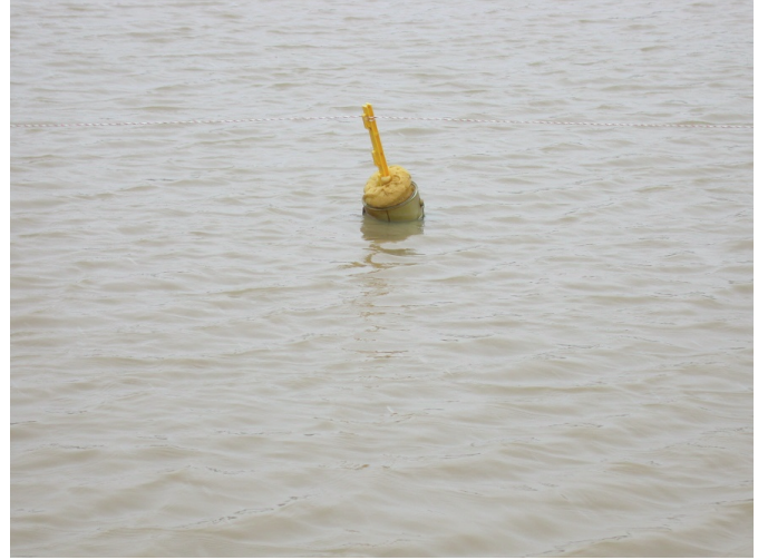
Figure 4. Floating posts can be built from an old paint bucket that is filled with foam and weighted at the bottom to keep the post upright.

Some devices are more suitable than others, and there are a few things that should be considered when using a pond as a water source. In general, the pond water needs to meet the basic standards to serve as drinking water – free from chemical impurities that may affect cattle health and free of pathogens as much as possible. Ponds used for cattle watering away from the banks are usually clean, as cattle do not loaf in the bank vicinity and thus pathogen loads should be small. Ponds may serve multiple purposes, such as raising fish, watering livestock and offering recreational opportunities. Under these circumstances, care should be taken so